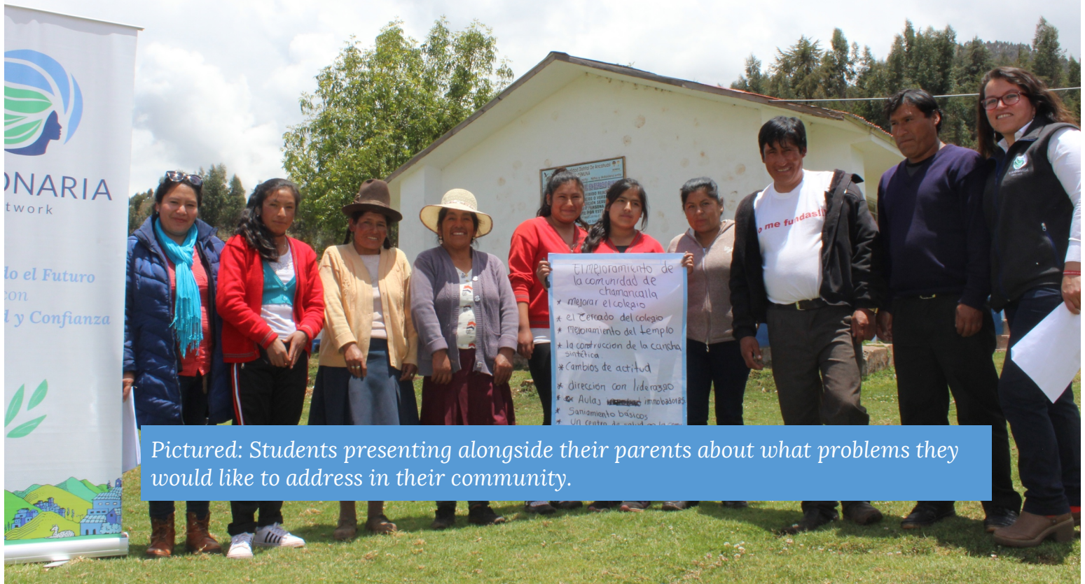
Pictured: Students presenting alongside their parents about what problems they would like to address in their community.

Our 2018 “Caravana Visionaria” roadshow reached 11 out of 12 partner schools and engaged more than 655 students, parents, and faculty during the month of October, 2018.